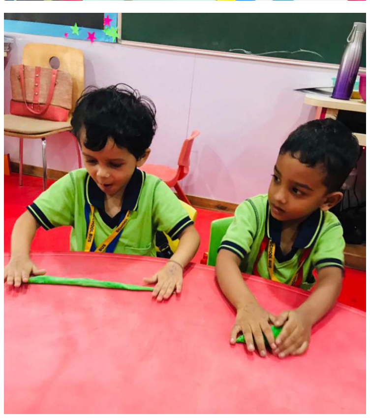
I MADE A CLAY SNAKE