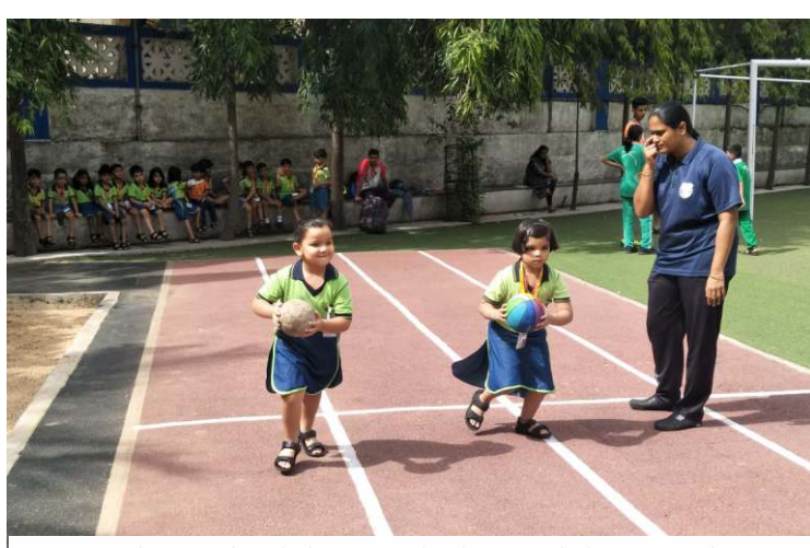
RUNNING & RACING ON THE GROUND IS OUR FAVOURITE