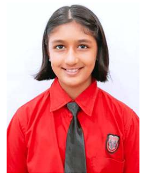
Gayatri Samudra Primary Checkpoint

Parents expressed their appreciation towards the teachers for their continuous and dedicated effort in moulding the students. Students presented a song for their teachers as an expression of their love and gratitude.