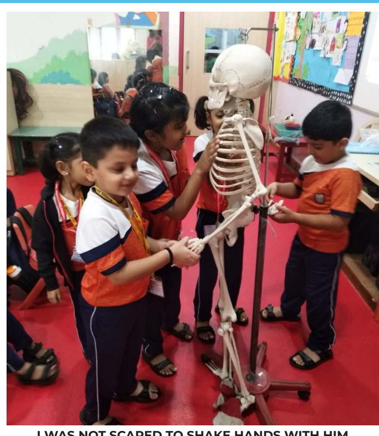
I WAS NOT SCARED TO SHAKE HANDS WITH HIM