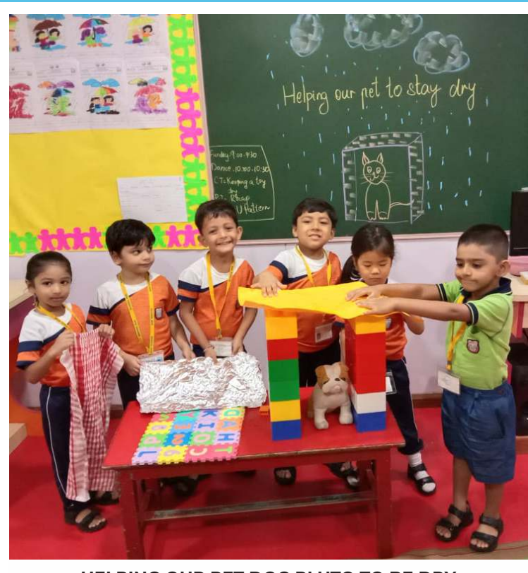
HELPING OUR PET DOG PLUTO TO BE DRY WHEN IT RAINS, BY BUILDING HIM A STRONG HOME