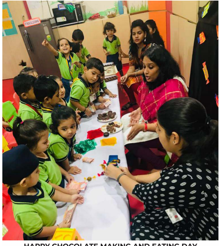
HAPPY CHOCOLATE MAKING AND EATING DAY