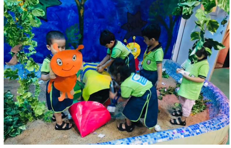
EXPLORING MOONBEAM'S ROCKET THAT CRASHED