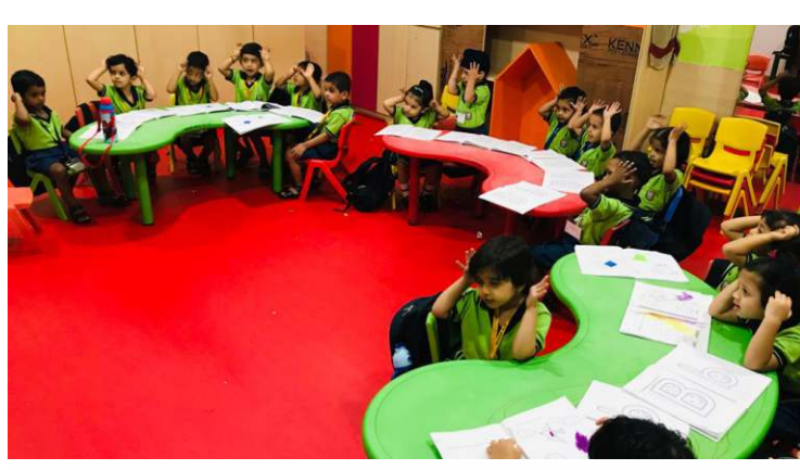
WE LEARNT ABOUT BOUNCY BEN