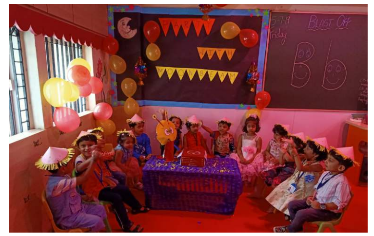
HAPPY BIRTHDAY MOONBEAM