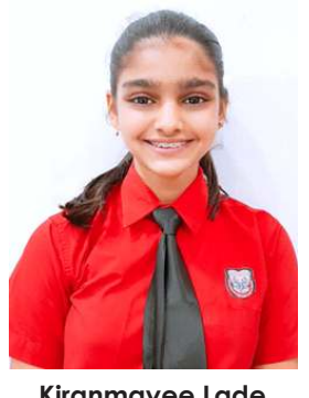
Kiranmayee Lade Primary Checkpoint