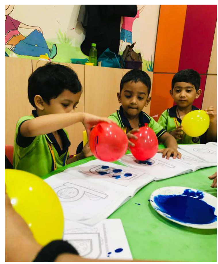
BALLOON DABBING IS SO MUCH FUN