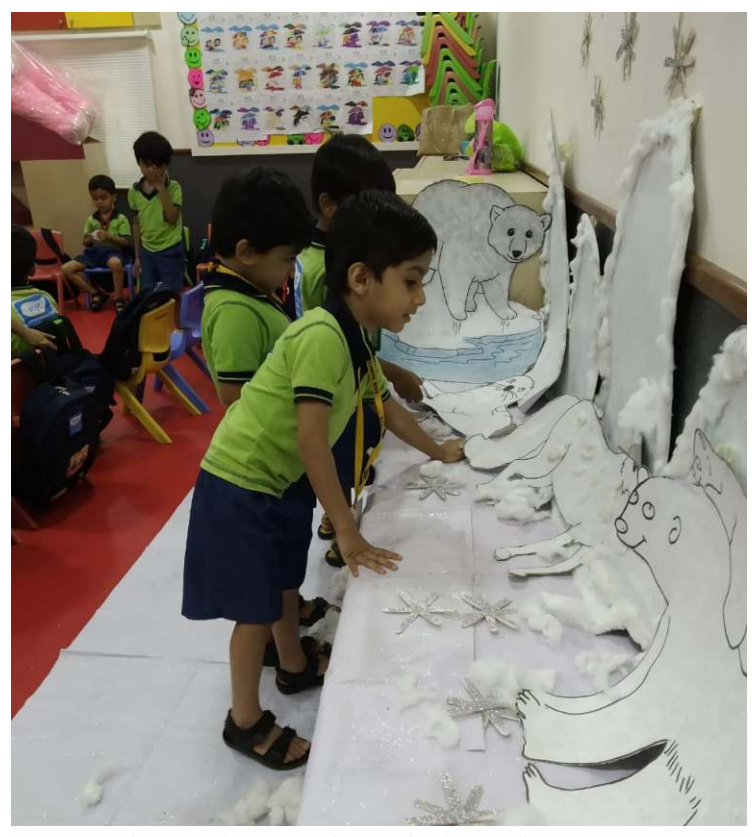
SETTING UP A POLAR SNOW MOUNTAIN