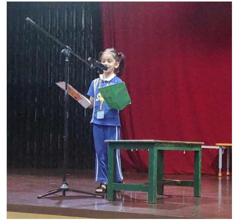
Winners | Afternoon shift