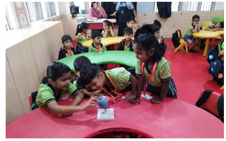
EXPLORING THE MODEL OF HEART & ITS 4 CHAMBERS