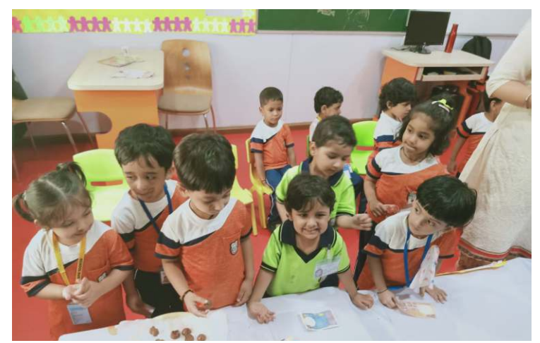
CHOCOLATE DAY WAS THE BEST