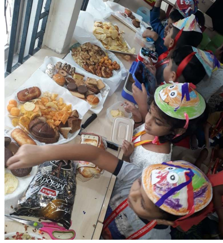
A GOOD PARTY NEEDS GOOD FOOD