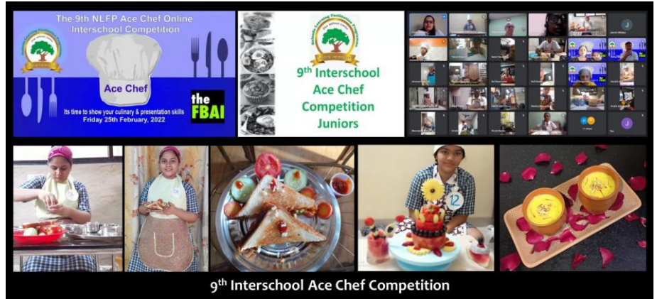
9 th Interschool Ace Chef Competition