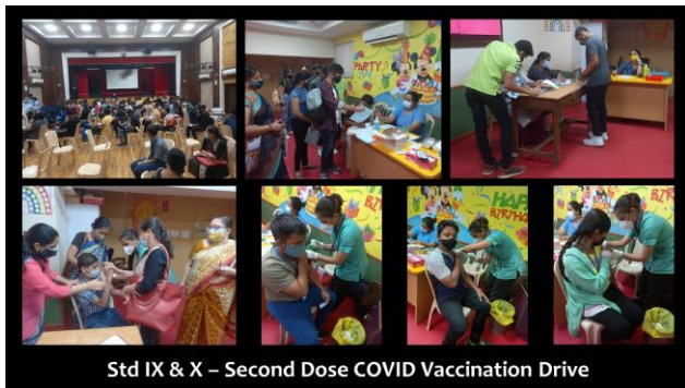
Std IX & X – Second Dose COVID Vaccination Drive

The second dose of the COVID vaccine was given free of cost to students of Std IX and X in the school premises on 18th February. Students of Std IX who were now eligible for their first dose were also given vaccination.