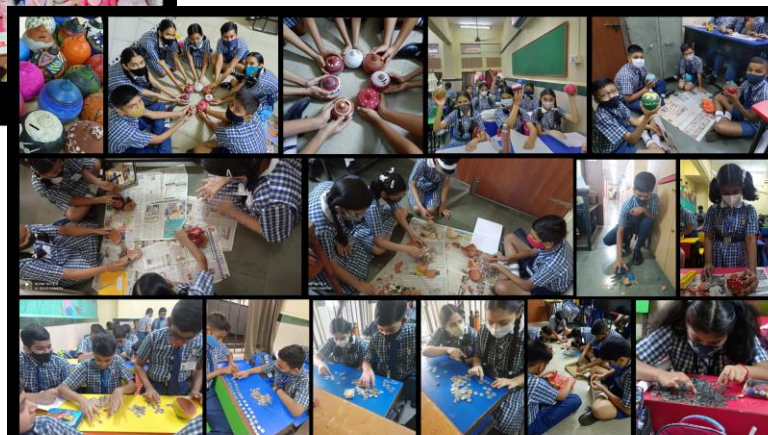
Pot-breaking SSR Activity

Secondary Section honoured their section women staff with poems, inspirational messages, cake cutting and a beautiful gift.