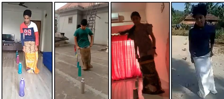
SACK RACE COMPETITION

All three competitions were conducted category wise and the judgement was done by Sports Teachers and Sports Event Managers.