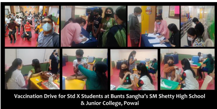
Vaccination Drive for Std X Students at Bunts Sangha's SM Shetty High School & Junior College, Powai

January began on repeat mode with us once again resuming purely online methods of instruction due to guidelines by the State Government. But this did not deter us from organising interesting and challenging activities.