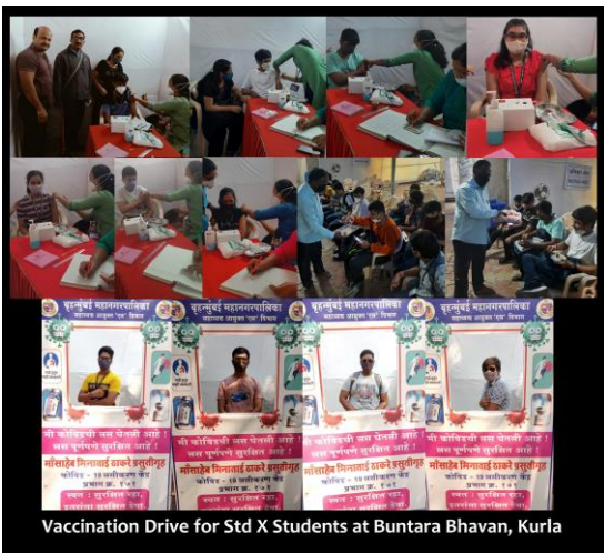
Vaccination Drive for Std X Students at Buntara Bhavan, Kurla