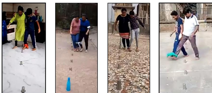
THREE LEGGED RACE COMPETITION