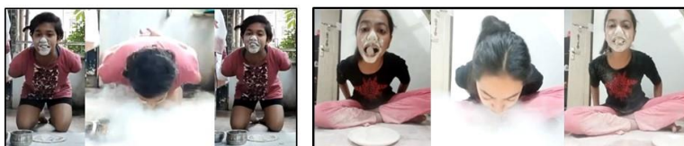
SEARCH THE COIN FROM FLOUR COMPETITION

Using mouth, a student picked two coins of Rs. 10 kept under flour in a plate by blowing the flour. Based on the minimum time taken to find both the coins, first four winners were declared.