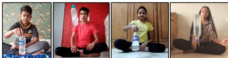
FLIP THE BOTTLE COMPETITION

In five attempts, a student flipped a half litre water bottle which was filled with water up to one fourth level. Based on whether the bottle stood erect after flipping and attempt number, points were given to the students. First four winners were declared based on the maximum score.