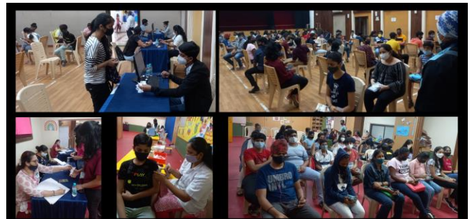
Vaccination Drive for Std IX Students at Bunts Sangha's SM Shetty High School & Junior College, Powai

With the rising cases, our Std X students were the key areas of concern due to the upcoming SSC Board exams. We arranged a free Covaxin Vaccination Drive for the Students who had completed 15 years of age at Buntara Bhavan, Kurla on 11th and 12th of January. On 14th January it was held in the school premises for Std X and on 15th it was arranged for eligible students of Std IX. Covaxin was mandated due to its short interval between two doses so that all our students would be completely vaccinated