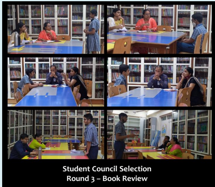
Student Council Selection Round 3 – Book Review

The third round of the Student Council Selection i.e. the Book Review Round was conducted for Std VIII on 27th June, for Std IX position of Sports Captain on 28th June and for Std IX position of Head Boy and Head Girl on 29th June. For the position of Deputy Head Boy and Deputy Head Girl, students were given a book in English, for Sports Captain in Hindi and for Head Boy and Head Girl in Marathi.