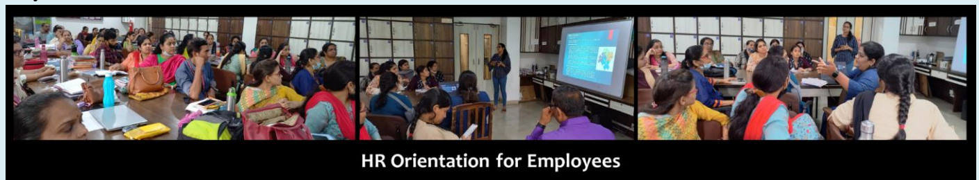
HR Orientation for Employees

The fourth round of student council selection i.e. Personal Interview Round was conducted on 5th, 6th and 7th July. Three rounds of personal interviews were conducted for each post consisting of judges from former student council, counsellors and heads of institution.