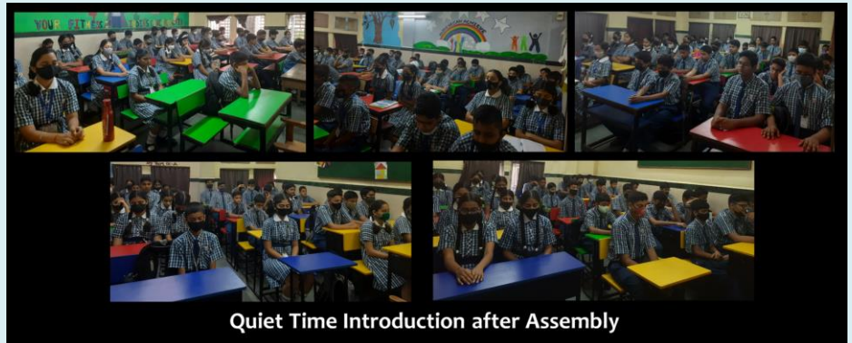
Quiet Time Introduction after Assembly

The student's from VI to X were welcomed on their first day of school which was 15th June. They were introduced to their teachers, subjects and the guidelines to be followed through the year. 5 minutes of quiet time was also introduced after the assembly.