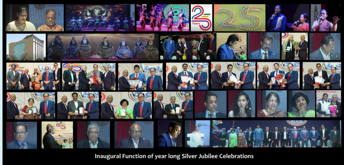
Inaugural Function of year long Silver Jubilee Celebrations