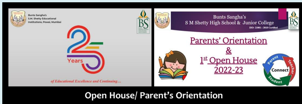
Open House/ Parent's Orientation

The Open House/ Parent's Orientation was organized for class VI - X on 2nd July. Parents were briefed about the activities taken up in the school along with instructions in the calendar regarding leave, fees, etc. Contact details regarding the website, counselling department, sports department, etc were also shared.