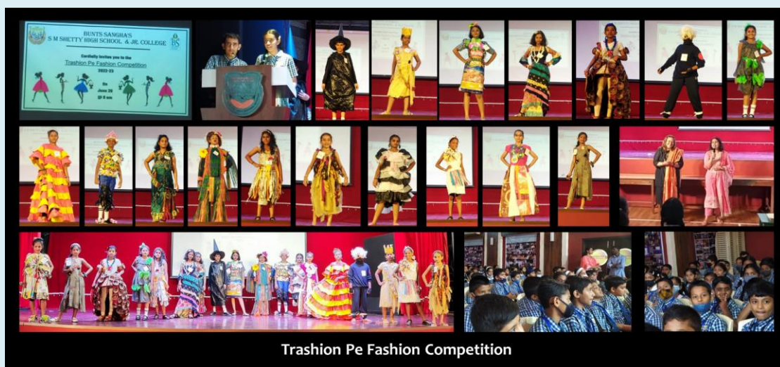
Trashion Pe Fashion Competition

The first inter house competition began with Trashion Pe Fashion for Std VI - IX. The students created unique and creative garments and accessories from waste which they displayed through a runway show.