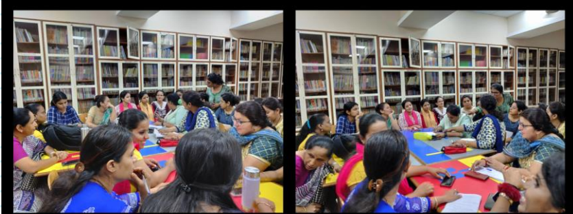
Language Development Meeting